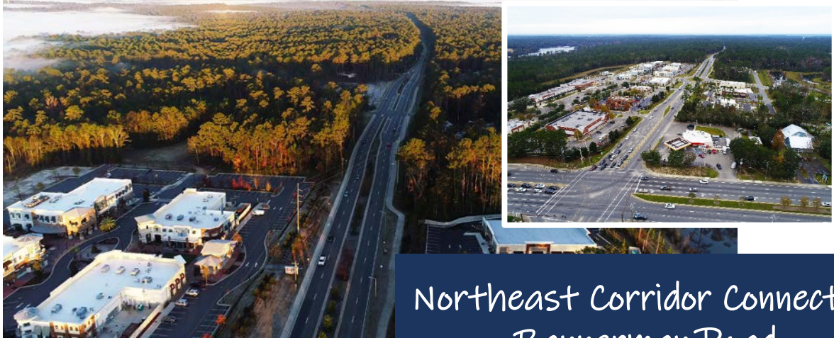
Northeast Corridor Connector: Bannerman Road