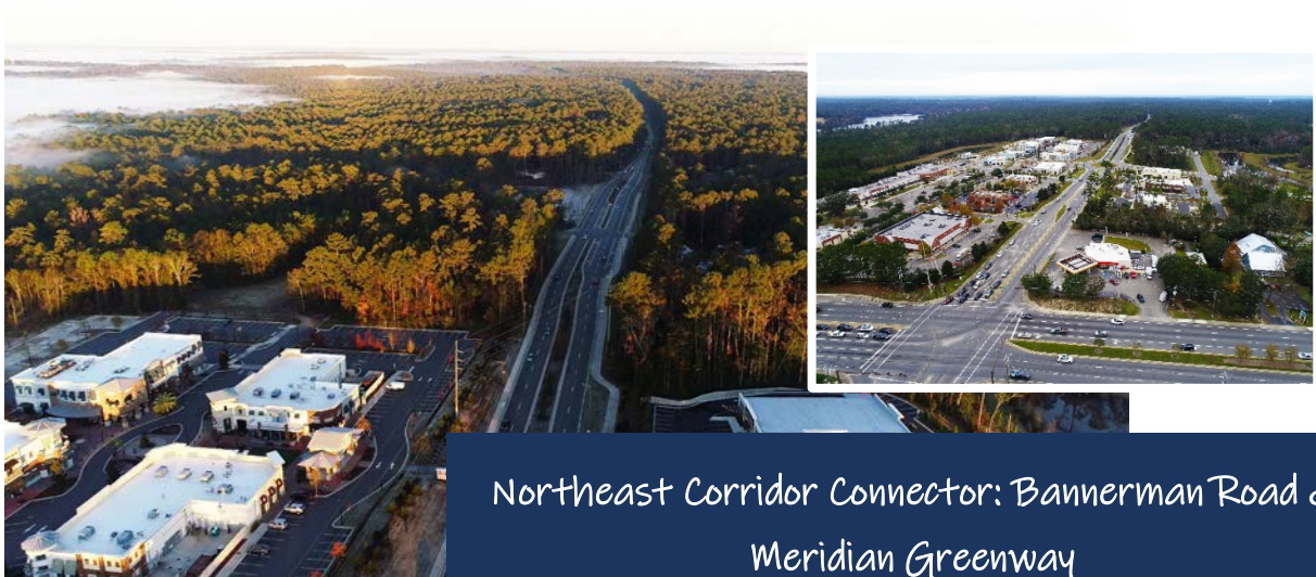
Northeast Corridor Connector: Bannerman Road & Meridian Greenway