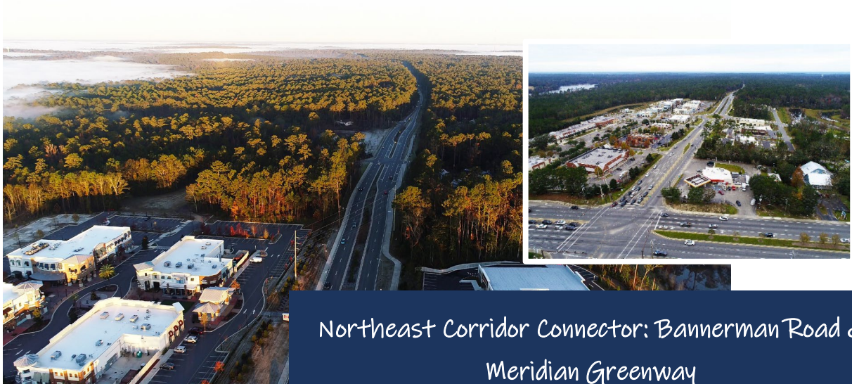
Northeast Corridor Connector: Bannerman Road & Meridian Greenway