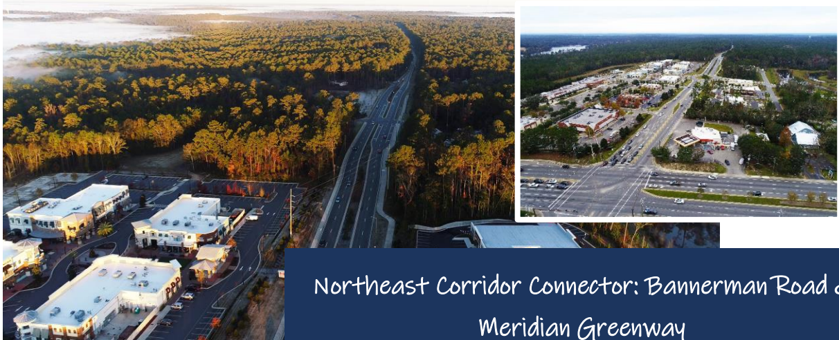
Northeast Corridor Connector: Bannerman Road & Meridian Greenway